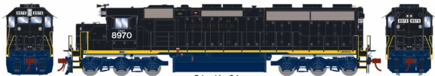
Primed for Grime